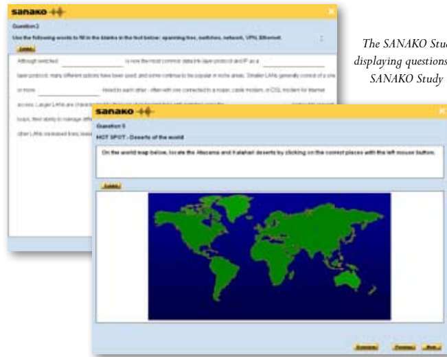
The SANAKO Study Exam Player displaying questions created with the SANAKO Study Exam Wizard.