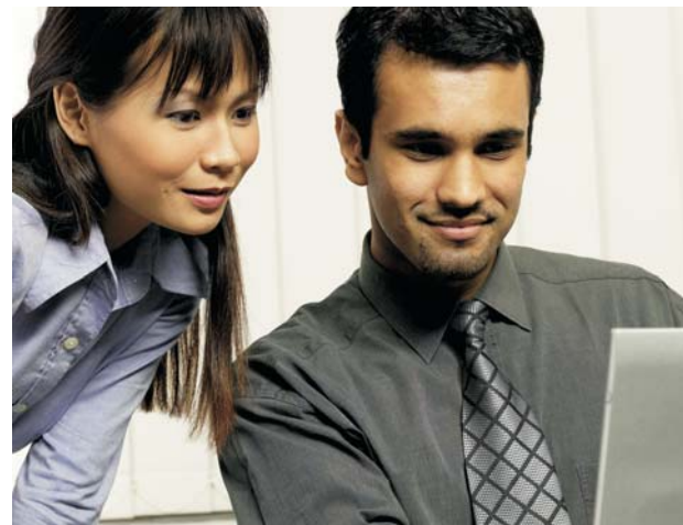
SANAKO Services ensure full customer satisfaction.