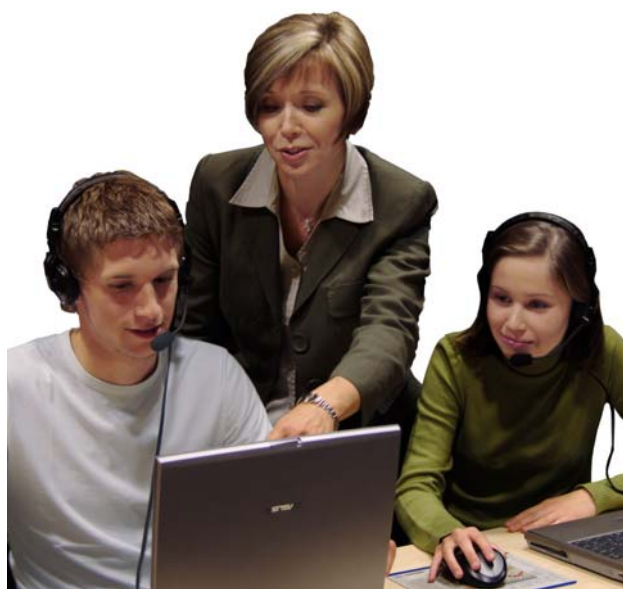
The personalized training that forms part of the SANAKO services gives teaching personnel full confidence in using the latest technology in their work.

By verifying the contents of the packing list, SANAKO makes sure that all components are included in the delivery of the system. Careful pre-shipment inspection eliminates the possibility of inconvenience or delay resulting from missing components.